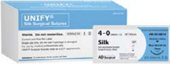
SILK 4.0 Sutures SILK 4.0 Sutures (12 per box)