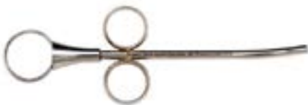
8020 Bone Syringe $59.99