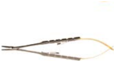
7001 Curved Castroviejo Needle Holder 16cm $149.00