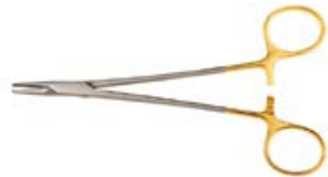
6915 Suture Needle Holder 15cm $69.99