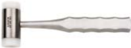
7243 Mallet $80.00