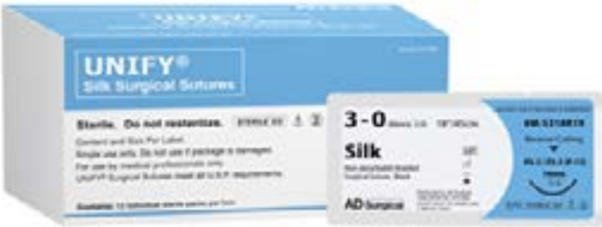
SILK 3.0 Sutures SILK 3.0 Sutures (12 per box)