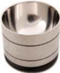
8019 Bone Well $30.00